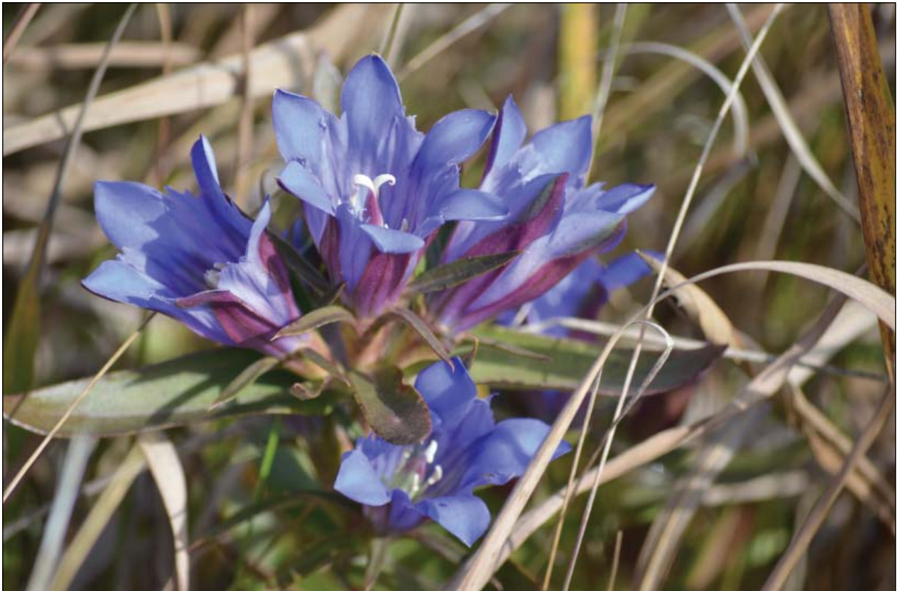
Downy Gentian ( Gentiana puberulenta )

These are just a few of the jewels in Mother Nature's treasure chest that keep me coming to the prairie when most others have put the season behind them. If all who refer to the prairie as a "mere field of grass" knew the treasure the prairies hold, these fields would be very busy place. Thank goodness they don't.